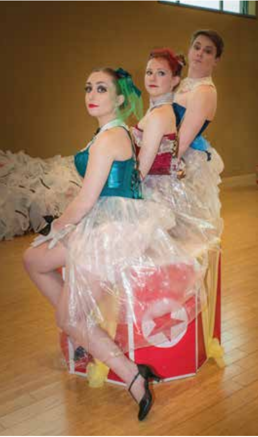
Carnival of Ruin.