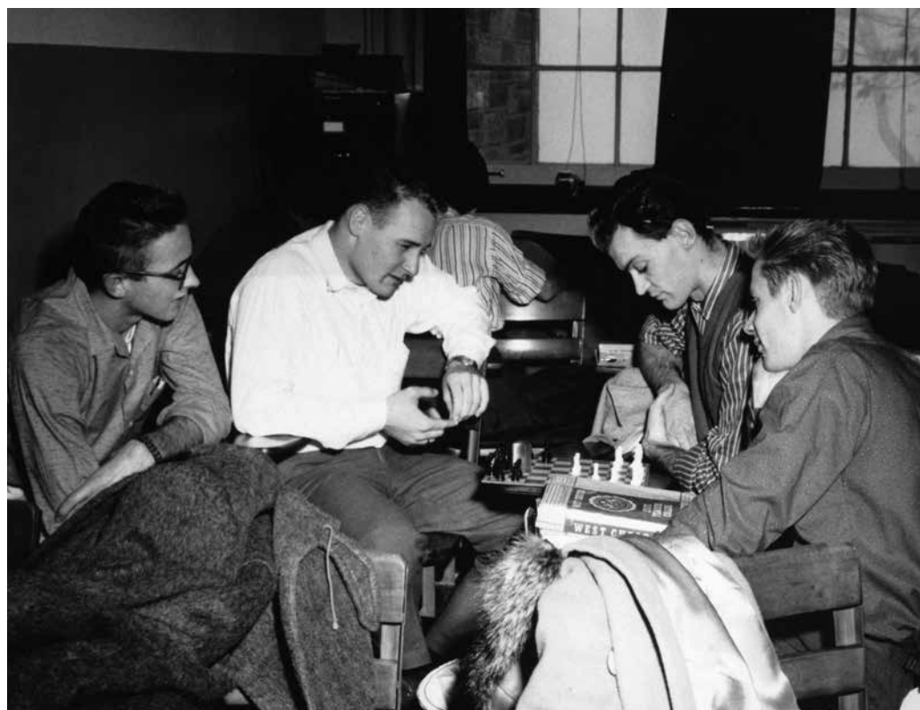
1950s Chess Match. >