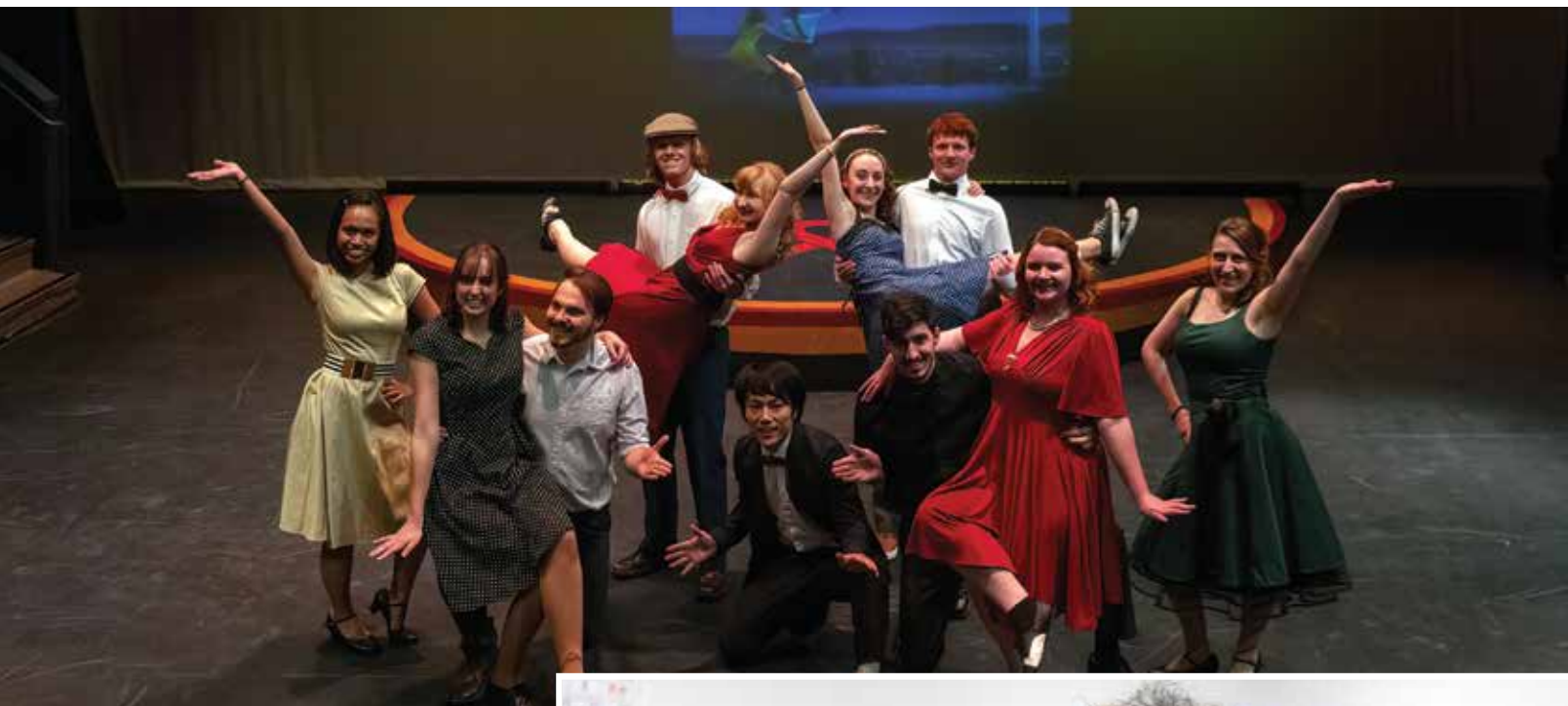
^ Theatre and Dance students in the Broadway Cares: Equity Fights AIDS fundraiser.