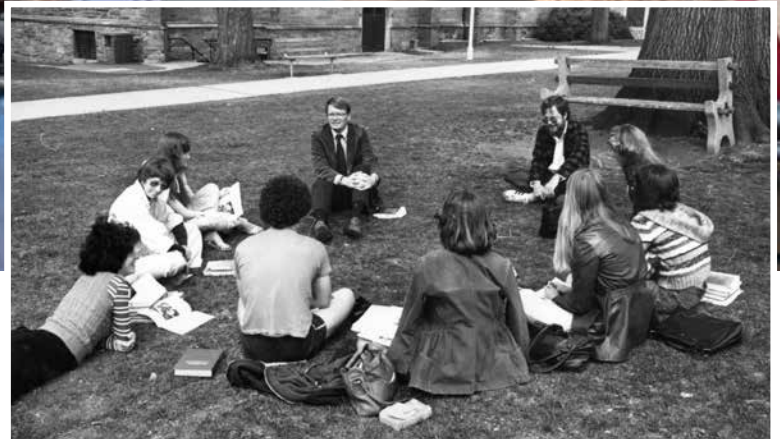
↑ Outside class “rooms” now and then. Top: RUCCAS Pop up Class.