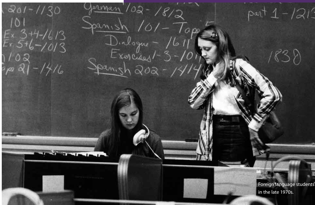
Foreign language students in the late 1970s.