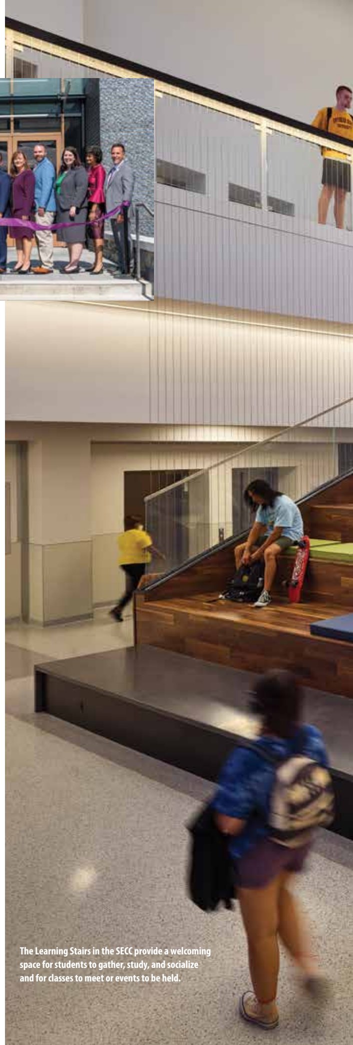
The Learning Stairs in the SECC provide a welcoming space for students to gather, study, and socialize and for classes to meet or events to be held.