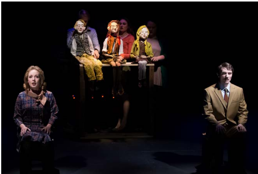
The Long Christmas Ride Home 2016