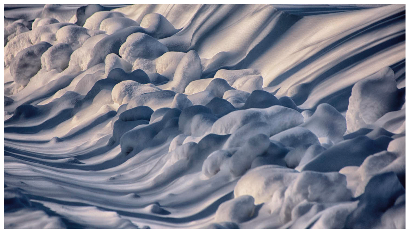
Winter snow storms can be inconvenient but they also can be a thing of beauty, as seen in this image from nearby White Clay Creek Preserve

The deadline to apply is March 15. The online application form and more information can be found at http://www.wcupa.edu/research/. If you or your students have additional questions, contact Pillay at gpillay@wcupa.edu or 610-436-3592.