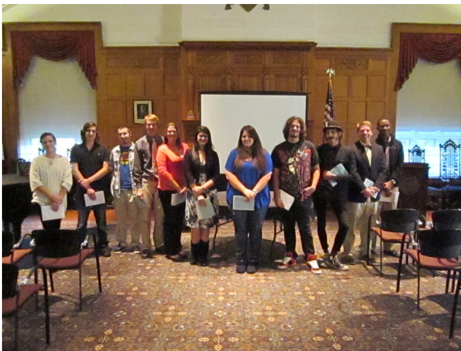
Phi Sigma Tau Inductees 2011